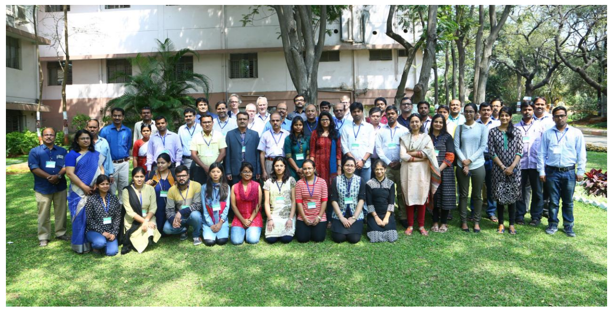
Participants and Speakers at the Research Methodology workshop on 'Scenarios and Models in Biodiversity and Ecosystem Services' at co-oragnised with Centre for Economic and Social Studies (CESS), Hyderabad, at CESS, February 2017

Pre-conference Methodology Workshop on Scenarios and Models in Biodiversity and Ecosystem Services co-organized with division for Sustainable Development Studies, Centre for Economic and Social Studies (CESS), Hyderabad with support from Belmont forum through the Ministry of Earth Sciences, at CESS, 14 February 2017.