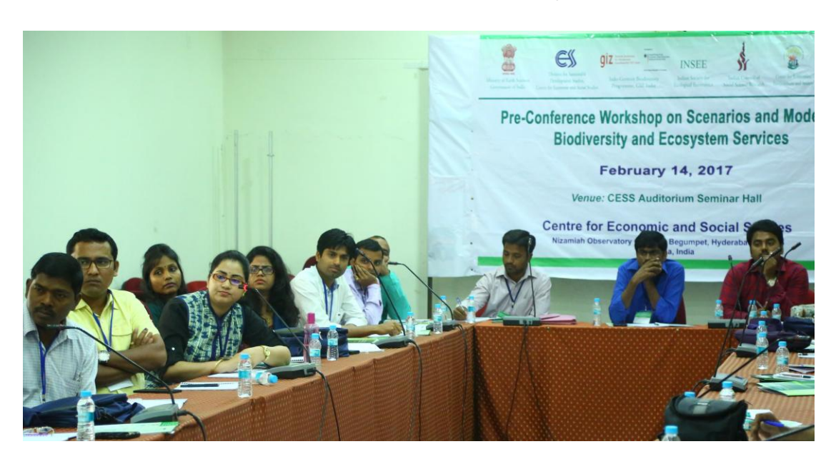
Participants of 'Scenarios and Models in Biodiversity and Ecosystem Services'