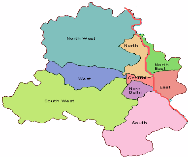
Figure 1: Districts in New Delhi

plants and capacity has increased over time; as of 2008, the treatment capacity was 3,250 MLD at 100% capacity utilization. In other words, only about 70% of the wastewater generated in Delhi could be treated (Narain 2012). There was no domestic reuse and the treated water was dumped into drains that nullified the whole process. As of 2018, the installed capacity is only 75% of the total wastewater generated in Delhi, and the utilization rate is about 75% (Gupta, Singh and Gandhi 2018).