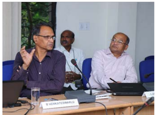
Panel by Cente for Economic and Social Studies