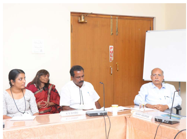
Panel by Kerala Institute for Local Administration