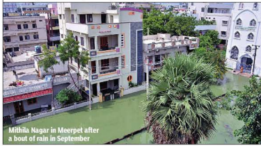
Milhila, Nagar in Meerpur after a bout of rain in September

Increase funding to combat disasters | Stating that Japan spent as much as 5% on disaster management, former World Bank executive, Vinod Thomas said that more funds were needed to upgrade infrastructure. GIZ's Rajeev Ahal suggested following Bihar's example in implementing a climate risk insurance