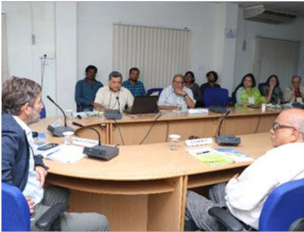
Panel on Martin Weitzman's Contributions to Ecological Economics by INSEE