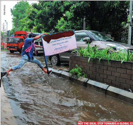
NOT THE IDEAL STEP TOWARDS A GLOBAL CITY

Increase funding to combat disasters | Stating that Japan spent as much as 5% on disaster management, former World Bank executive, Vinod Thomas said that more funds were needed to upgrade infrastructure. GIZ's Rajeev Ahal suggested following Bihar's example in implementing a climate risk insurance