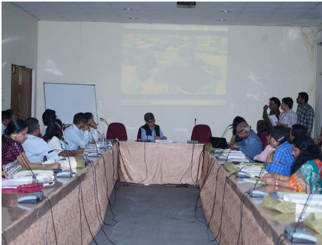
Panel by GIZ, India