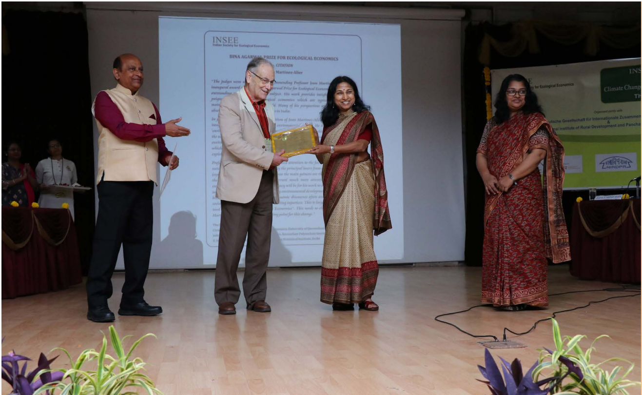
Bina Agarwal presenting the Plaque to Joan Martinez-Alier, Winner of the Bina Agarwal Prize for Ecological Economics