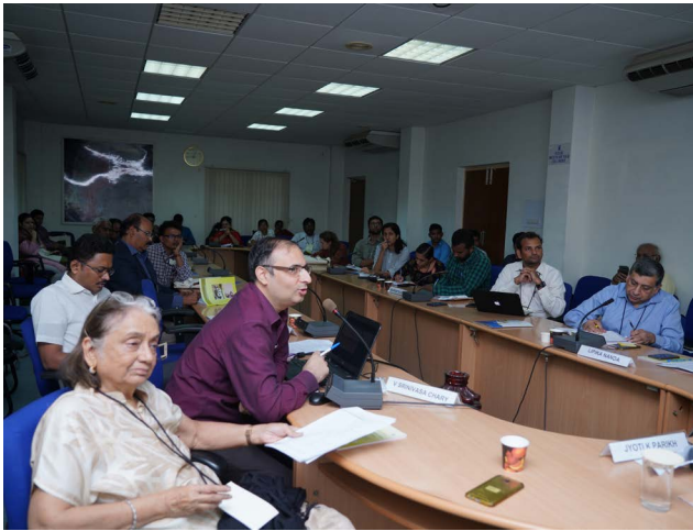
Panel by Integrated Research and Action for Development (IRADe)