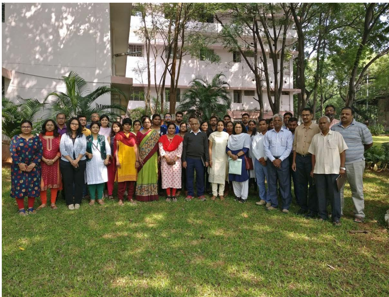
Participants and Resource Persons of the pre-conference workshop on Behavioral and Experimental Economics for Environmental Policy, held on 5th November at the Centre for Economics and Social Studies, Hyderabad.