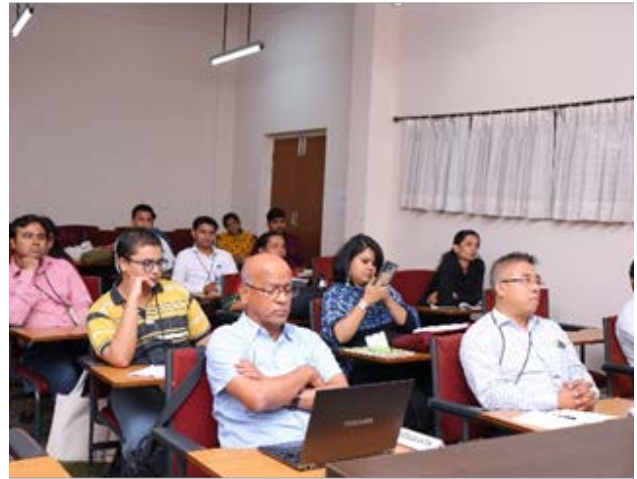
Panel by Indian Institute of Technology, Mandi and Guwahati