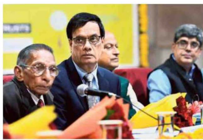
Participants at the 10th INSEE biennial conference on climate change at CESS in the city.

Quoting a study conducted by the Asian Development Bank, he said that by the year 2080, there could be a 10-40% drop in crop production, although a few varieties may show higher yields. "Carbon dioxide will be high with the overall temperature rise more than six degree Celsius," he said.