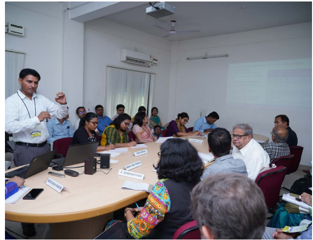
Panel by South Asian Network for Development and Environmental Economics (SANDEE)