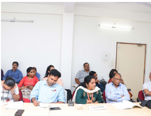
Panel by National Institute for Rural Development and Panchayati Raj