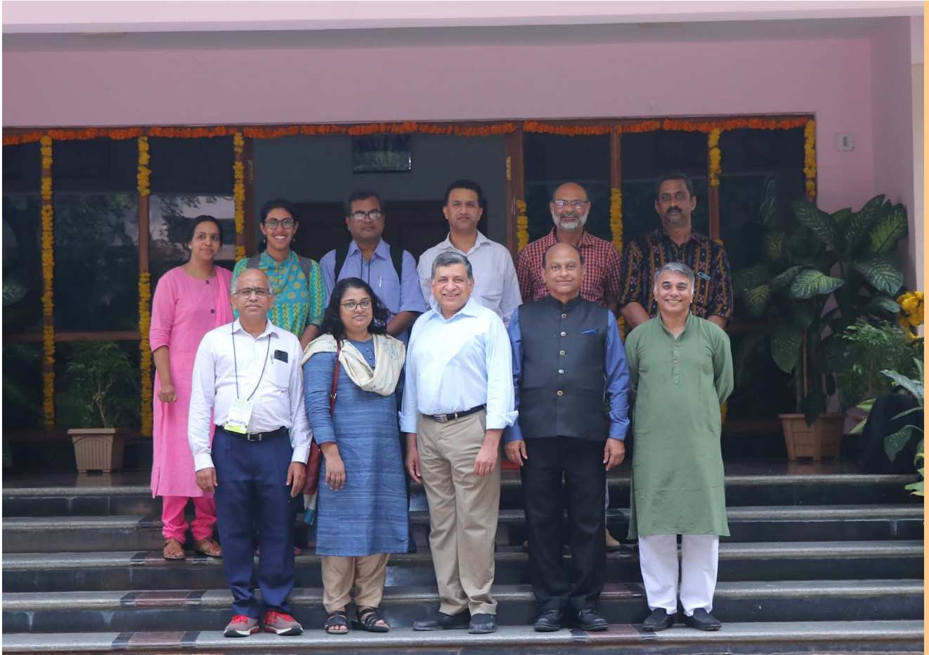
INSEE Executive Committee (2018-2020) members at the Centre for Economic and Social Studies, Hyderabad during the Tenth Biennial Conference 6-8 November 2019.