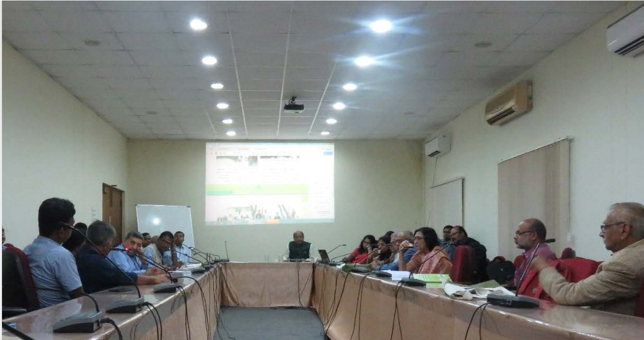
The 16th General Body Meeting of INSEE held on 6th November 2019, at CESS. Hyderabad