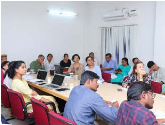
Panel by Foundation for Ecological Security