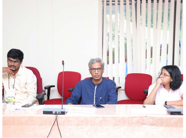
Panel by Madras School of Economics