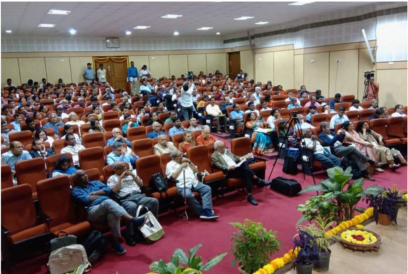
Participants of the INSEE-CESS International Conference, the Tenth INSEE Biennial Conference on Climate Change and Disasters: Challenges, Opportunities and Responses