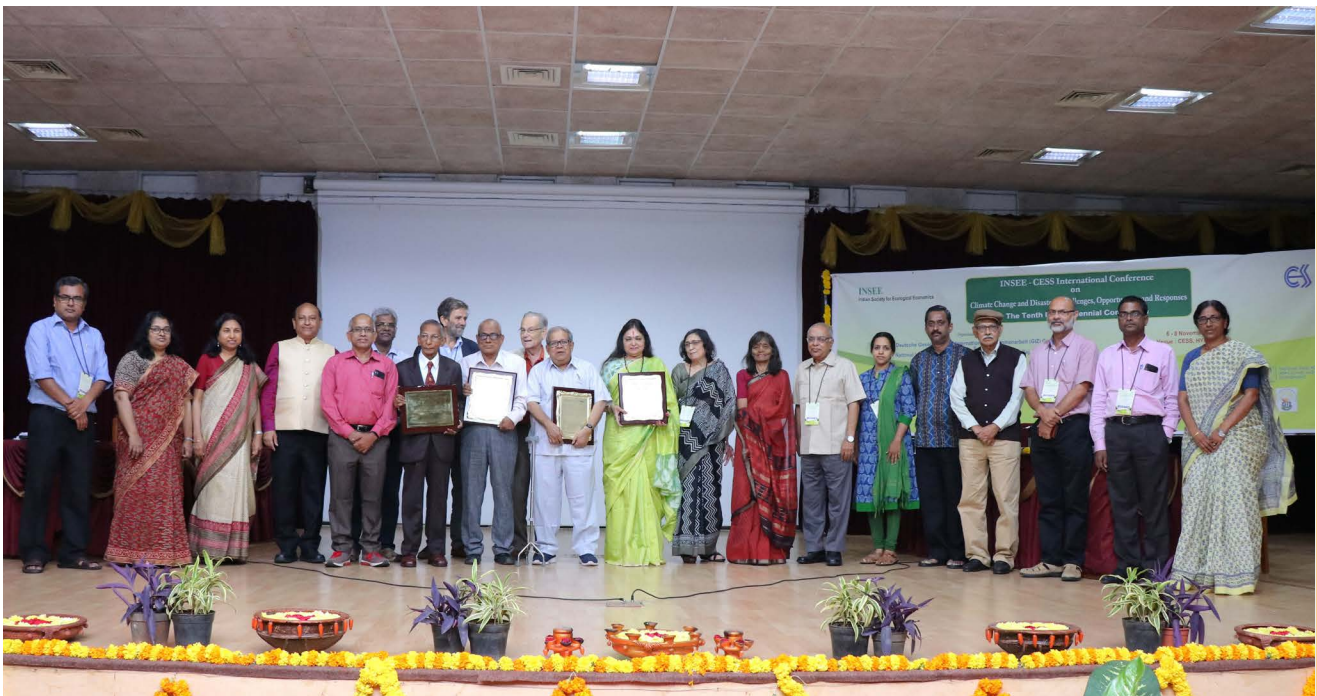
Current and Past INSEE Presidents, EC Members, Past ISEE and EAERE Presidents with the Prize Winners